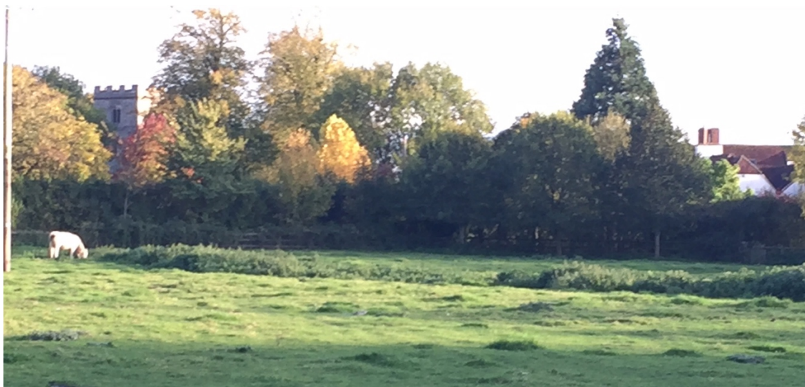
View from public footpath towards the Church (View 2)

Construction materials and finishes should reflect the surrounding area and the character and heritage of the immediate environment. Modern replacement and/or new build materials should visually compliment the immediate environment.