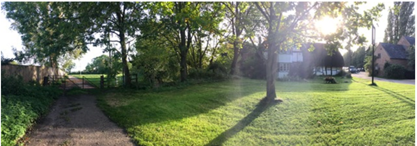
Approach to Clifden Arms and path towards Ickford (View 1)

11.1. There are 12 listed buildings in the Parish (source National Heritage List for England (NHLE)). Some of the most notable include The Clifden Arms, the Church and the Almshouses, the last two of which are Grade II*. The historic environment of the parish and heritage assets (both designated and undesignated) must be conserved and enhanced. Whilst there is no designated Conservation Area, the village includes several areas where the historic development of the village can be seen and the rural character is one of the most highly regarded elements of the village which the residents wish to see preserved. (Village Plan).